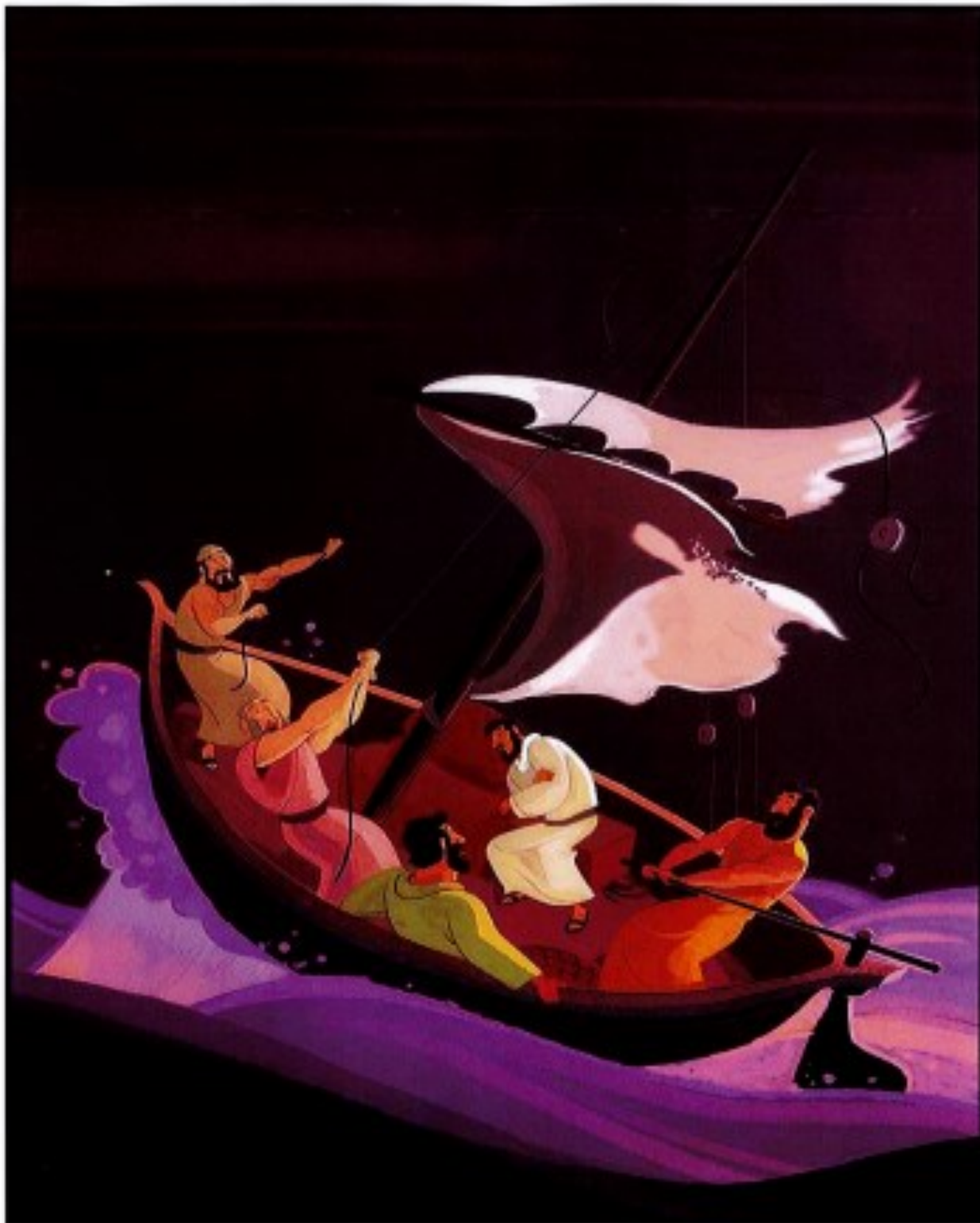
Jesus Calmed the Storm